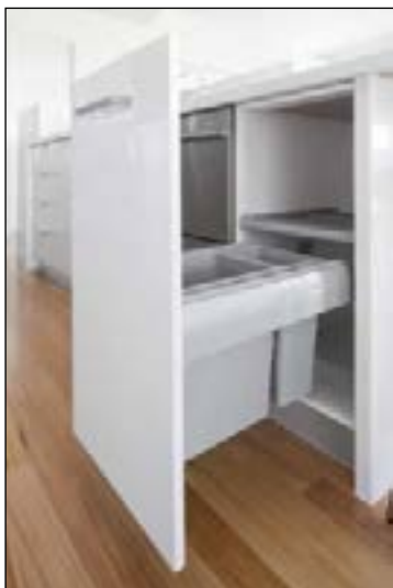
HAFELE: The One2Five Bin is a great example of today's recycling options.