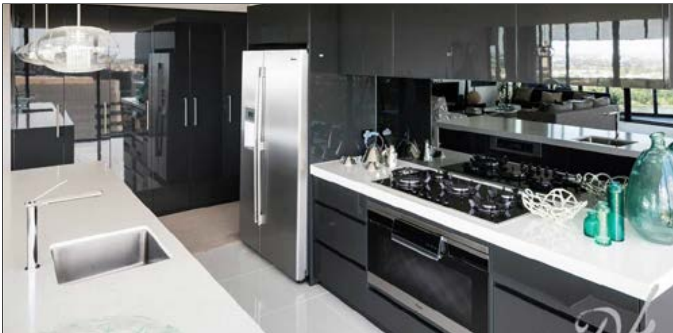
SPLASHBACK STYLE: An example of a mirror splashback.