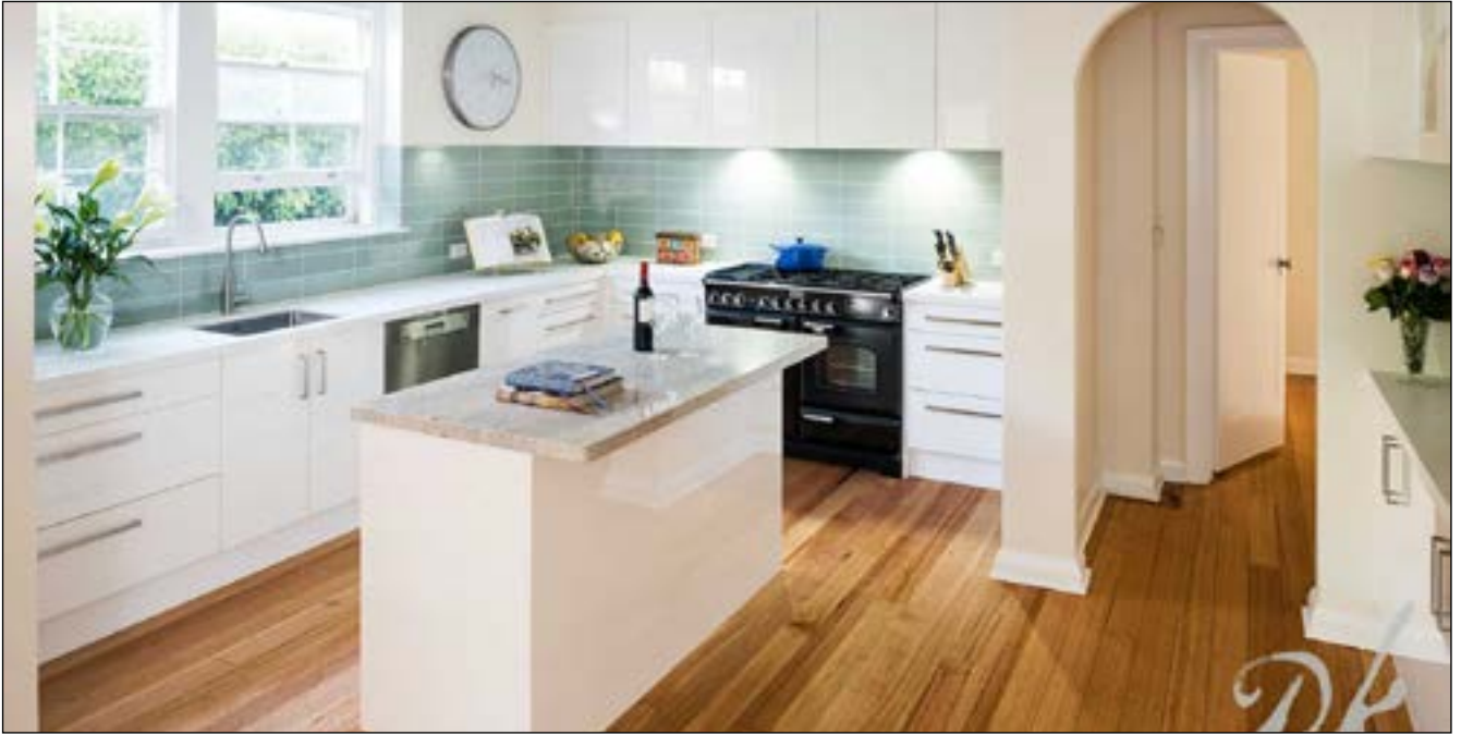
DOOR STYLE: An example of Thermo-laminated doors.