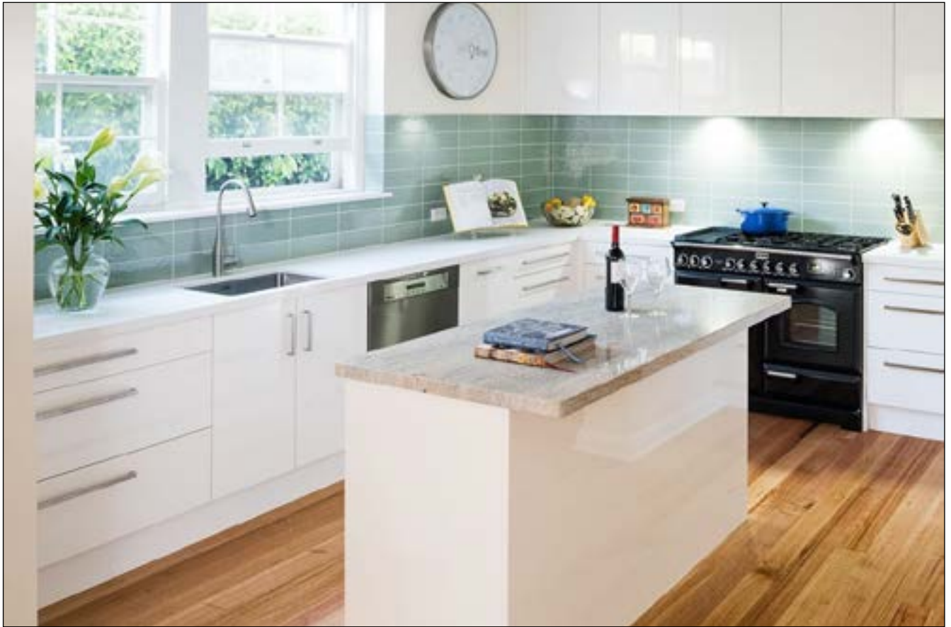
BENCHTOP STYLE: An example of a granite benchtop.