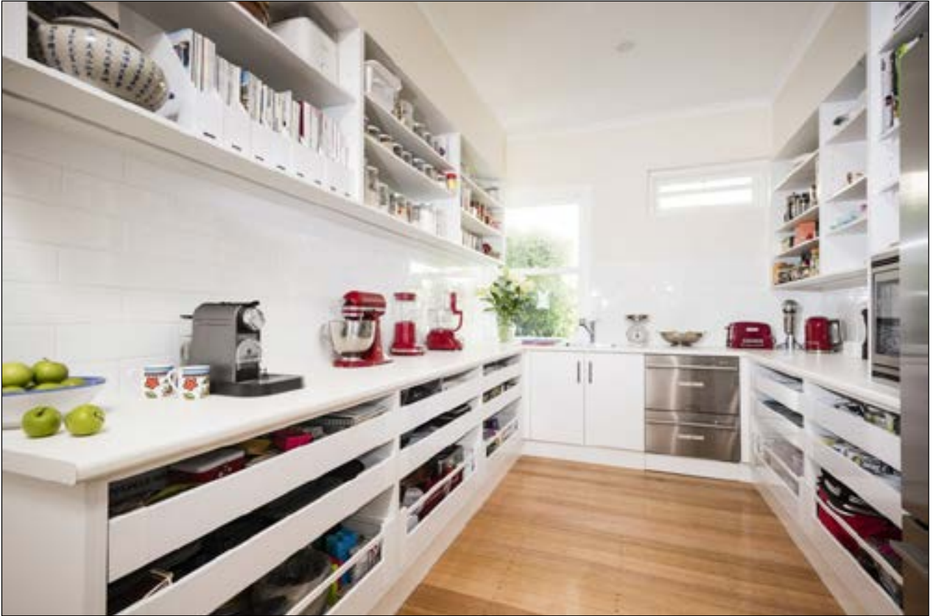
BENCHTOP STYLE: An example of a laminate benchtops.