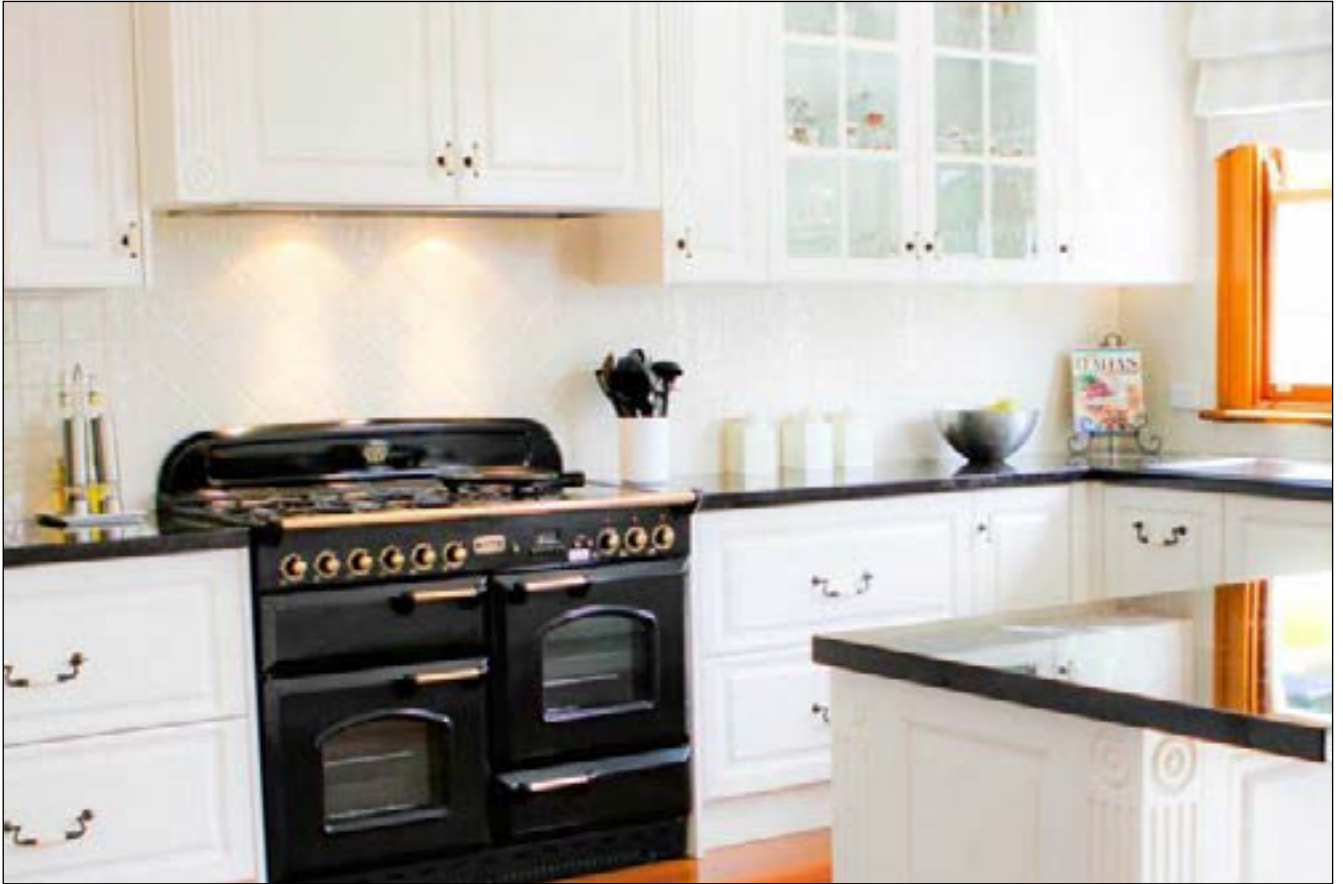
SPLASHBACK STYLE: An example of a tiled splashback.