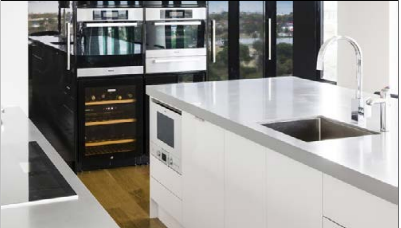
BENCHTOP STYLE: An example of a Corian benchtop.